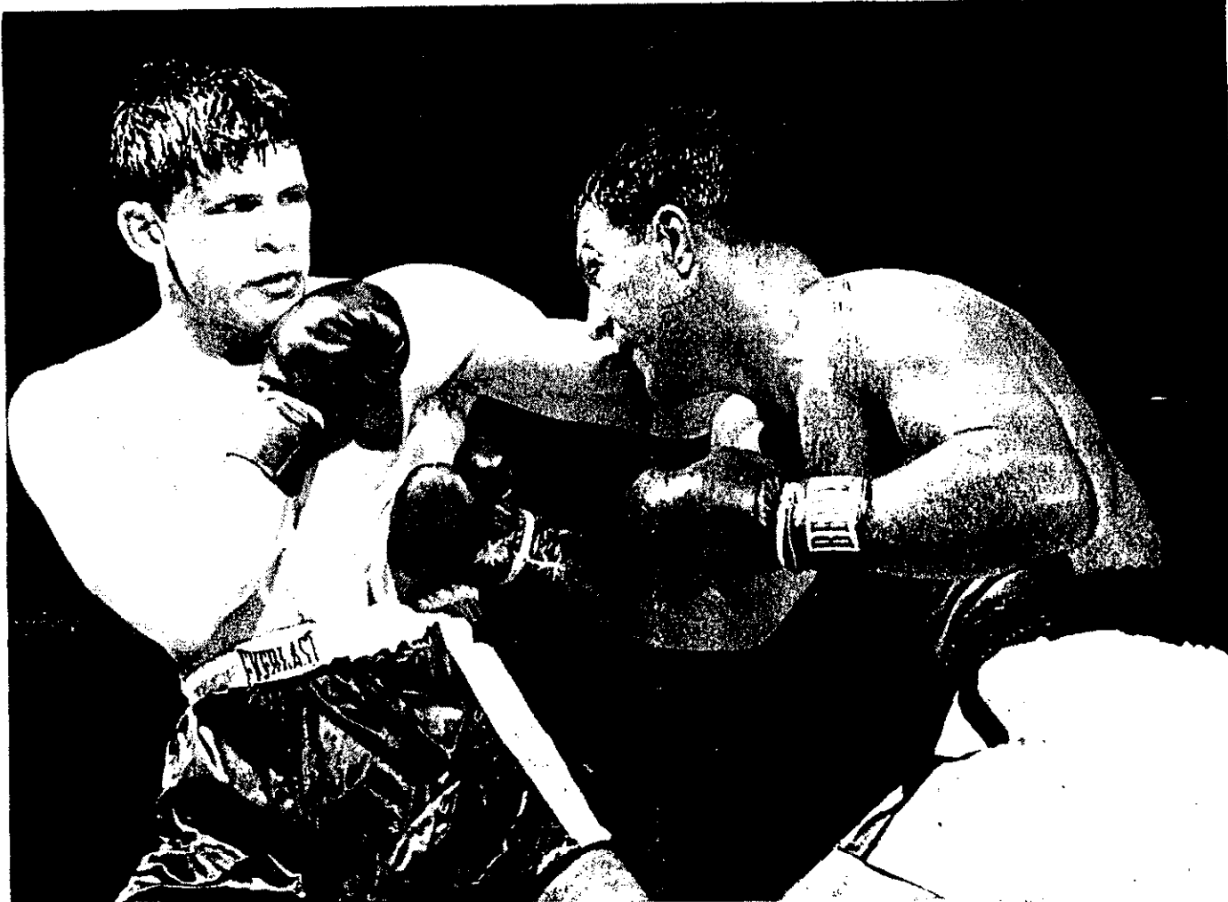
This seventh-round right to the ribs illustrates the type of punishment Marciano meted out in the second half of his September 1953 title fight vs. LaStarza. Banging LaStarza's arms and body, the Rock wore down his rival. Marciano scored a knockdown in the 11th, and though LaStarza rose, the bout was halted.

punch after punch. During the first five rounds, referee Ruby Goldstein warned the champion five times about low blows, and several times for punching after the bell. In the sixth, he awarded the round to the challenger because of the Rock's low punching. But from there on, Marciano took control and wore down his opponent.