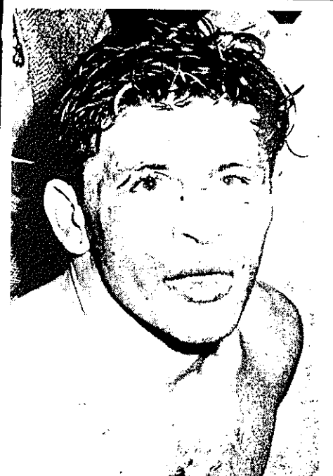
The Rock attacks in the second LaStarza fight (top). After being stopped in round 11, the challenger was battered but unbowed (above).

The first Duel of the Titans took place at Madison Square Garden on March 24, 1950. Marciano was unbeaten in 26 outings, with 24 knockouts. LaStarza was also unbeaten: 37 fights, 17 kayos.