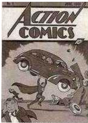
The first issue of Superman