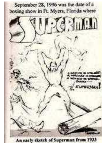
An early sketch of Superman from 1933