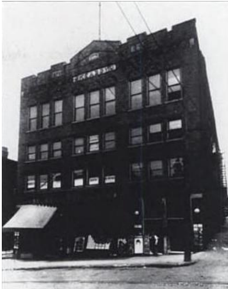
*The Keaggy Theater

of Pittsburg,” with part of the gate receipts going to benefit a sick baseball player from the Greensburg baseball team who was hospitalized, although the name of the player does not appear in any of the sources. The forecast that night called for cloudiness and rain, which would allow fight fans to attend the event without fear of being snowbound. All was set for a night of jabs, uppercuts, and knockouts. Peace on Earth was not to be found inside the squared circle that evening.