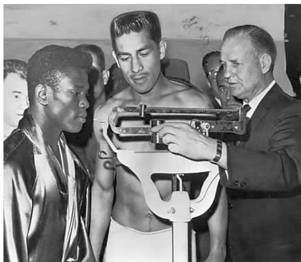
Emile Griffith and Gaspar Ortega Weigh in for their title fight