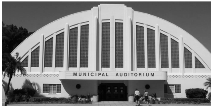
Hialeah Municipal Auditorium

Sir John Hotel (Club Night Beat) Top Black Hotel,