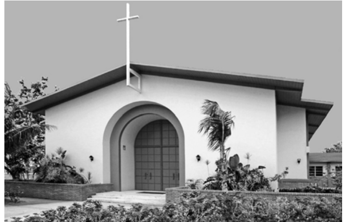
Our Lady of Perpetual Help Church

Our Lady of Perpetual Help Catholic Church Opa-Locka