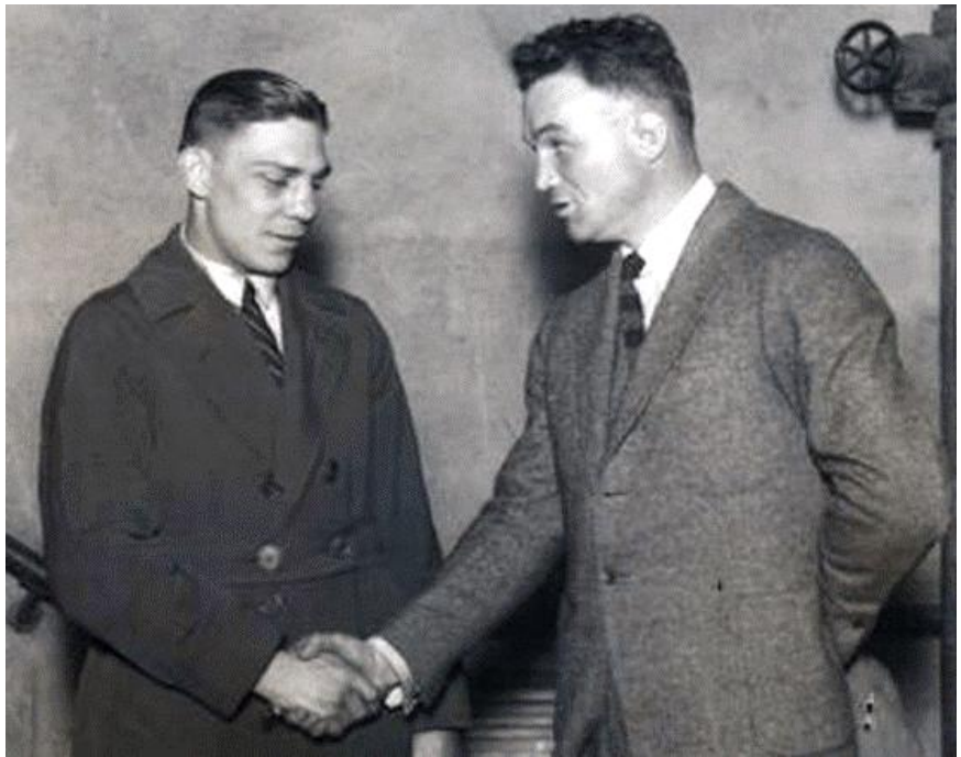
A cordial encounter between Greb and Gibbons.

This was never more evident than in the sixth round as Gibbons really started to lay it on thick against his foe. As The Pittsburgh Press wrote: "Round six: Greb's face puffs up. He is given a head shower. Greb begins his tango game, but before he does anything Tom is on top. Greb misses twice and is countered ... Tom drives left to body and Greb clinches. Gibbons mauls Greb on inside. Greb grabs again but breaks and hits a nice one. Tom pushes Greb to [the] ropes and pierces his guard with a straight left. In a clinch Gibbons gives Greb a 'going over.' Gibbons round."