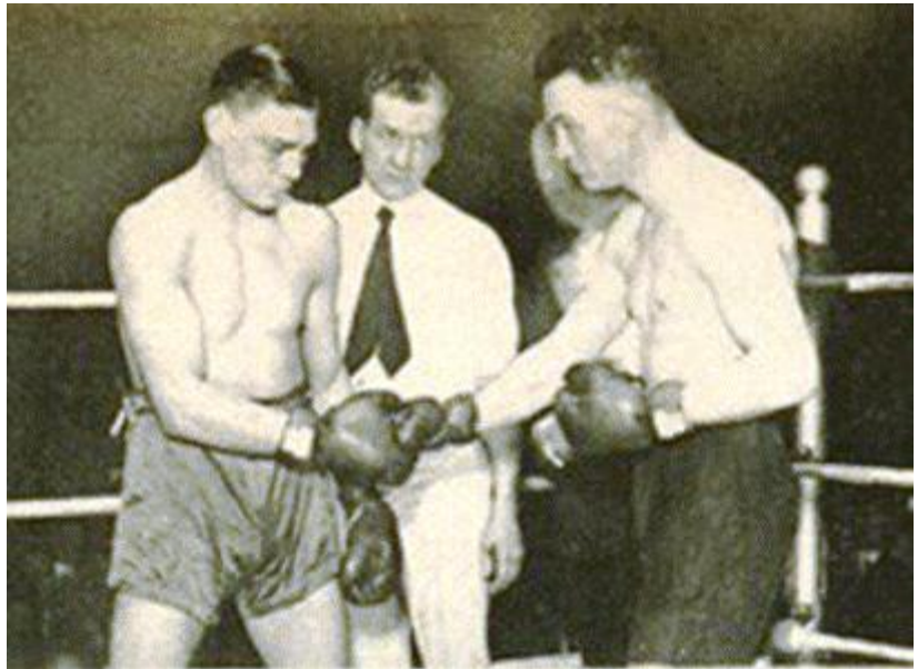
Greb and Gibbons pose before one of their four meetings.

That opening stanza provided what would be the only success Greb would have on that May evening in Pittsburgh. As the headline "Tom Boxes Like a Wizard" might suggest, it was clear that Gibbons' performance over the next nine rounds was spectacular. The Pittsburgh Post-Gazette described the extent of his wizardry when they wrote: "Gibbons blocked and slipped Greb's punches, lunges, swings and all the other varied assortment in the Pittsburgher's stock in trade with skill that was marvelous to behold."