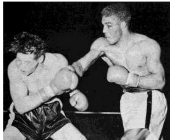
Joey Giardello absorbs a savage right from Rory Calhoun early in the fight.

On May 5, 1958, Rory met Joey Giardello in a rematch at the Cow Palace in San Francisco before a crowd of nearly 11,000. Giardello knocked Rory down twice in the early stages of the fight, and then hung on to gain a unanimous decision. Both fighters engaged in a savage brawl that included rabbit punches, hitting on the breaks, and low blows. Rory was dropped for a nine count in the fourth and a five count in the fifth. He held his own the rest of the way.