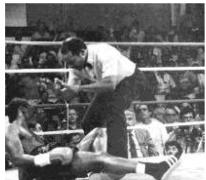
Curry is counted out in the fifth.

I spoke to Mike about the Curry fight when we met in Las Vegas. "Going into the fight I knew he had a terrific left jab, overhand right, left hook combination. He was using this combination to knockout fighters his entire career. But he was mechanical in throwing it, almost like hitting the heavy bag. I knew if he missed with an overhand right, he'd be off balance and vulnerable to a right uppercut to the body. That's what happened, he grunted when I landed the uppercut and my left hook was just for show." Watching video of the bout, Mike's description of what took place seems fairly accurate. For the record, the champ reenacted the KO in the dining room of the Texas Station Hotel. Unfortunately I got to play the role of "The Cobra", much to the shock of the dining patrons.