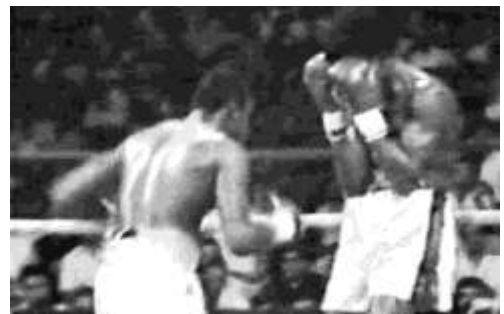
Mike McCallum stops Julian Jackson in the second round.

getting back into the fight, Jackson would score with a terrific punch to the head or body. Getting his wits about him during the rest period, Mighty Mike was ready when Jackson continued his assault in the second stanza. The St. Thomas banger while throwing wild punches at McCallum was leaving himself wide open. The champ was quick to take advantage of the situation, staggering Jackson